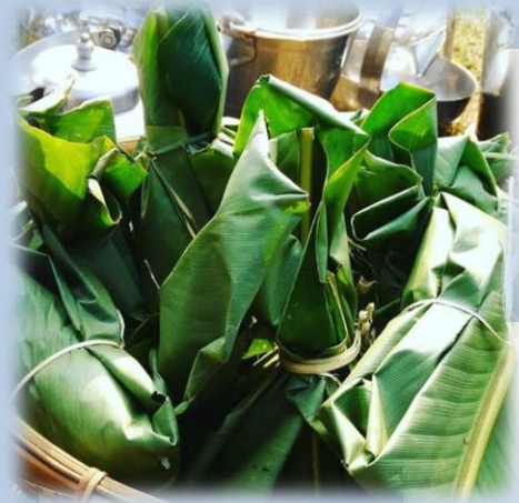
Enjoying Naga Delight : The Tupula Vat