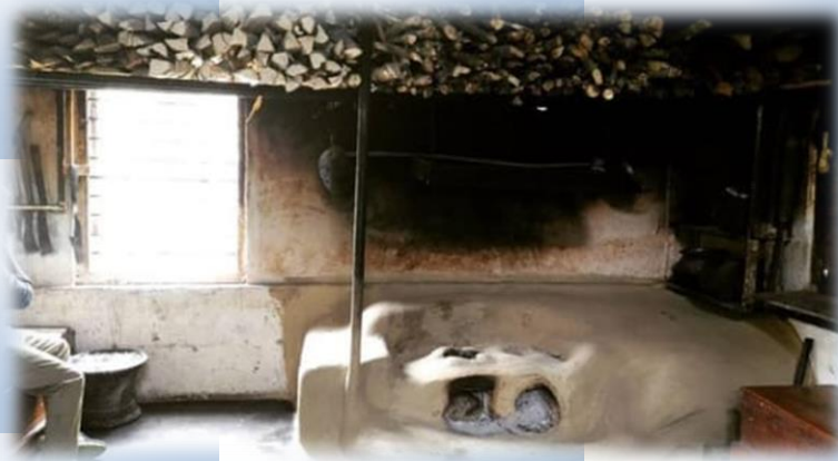
Naga Ethnic Kitchen