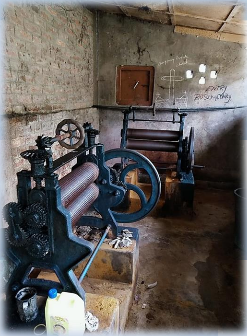
Rubber Making Machine